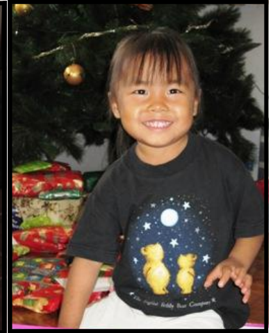
Look at her now!! Thank you for helping put a smile on the face of these precious children!